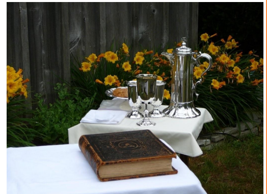
Right: Original communion set, circa 1859, from the first St. Paul's building, before it was destroyed in the Great Fire of Southampton in 1886. Photo taken in July 2009, at the 150th anniversary service at Pioneer Park.

St. Paul's Anglican Church , 248 High Street, Southampton, ON, N0H 2L0 519-797-2984