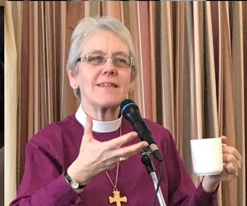
An informative Question and Answer session followed lunch.