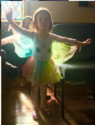
Even the youngest angels were dressed up for the Bishop!