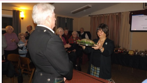
Robbie Burns Night— See inside!