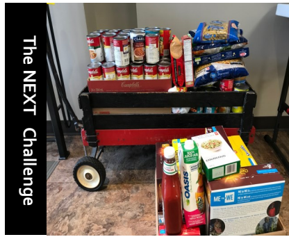
The NEXT Challenge