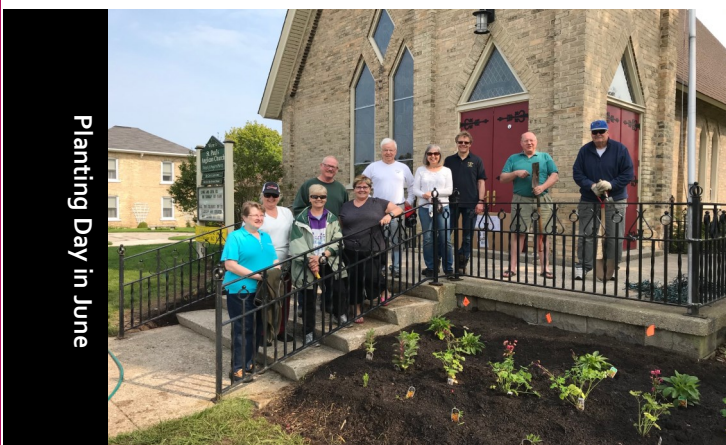
Planting Day in June

Striving to Safeguard the Integrity of Creation: