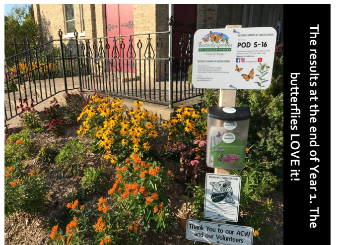
The results at the end of Year 1. The butterflies LOVE it!