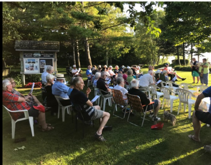
Marine Heritage service