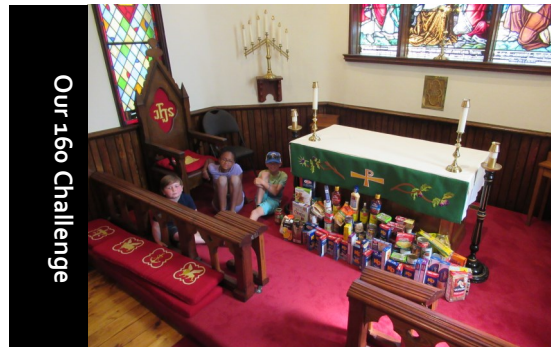
Our 160 Challenge

Responding to Human Need by Loving Service: