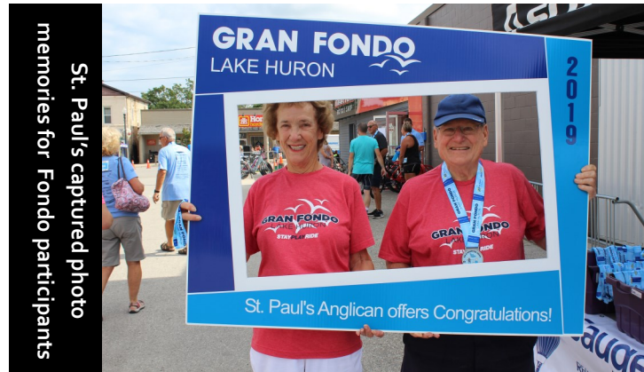
St. Paul's captured photo memories for Fondo participants