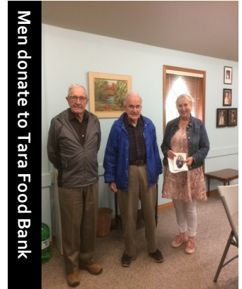
Men donate to Tara Food Bank